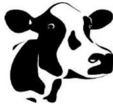
Animals and Farm Tours